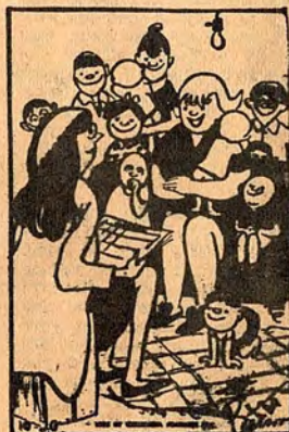
"We believe in family planning. We plan to buy color TV with our next relief check."