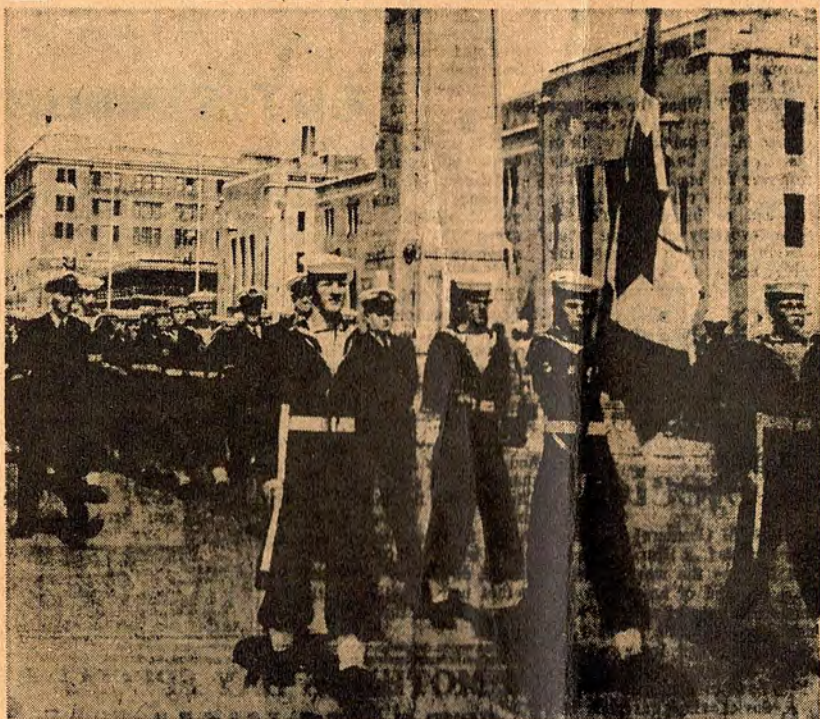
Front view of Colour Party and Guard of our corps, passing the Pentagon on battle of Atlantic Sunday.